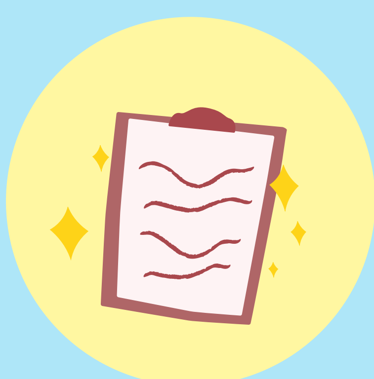
PERSONALISED CARE PLANS