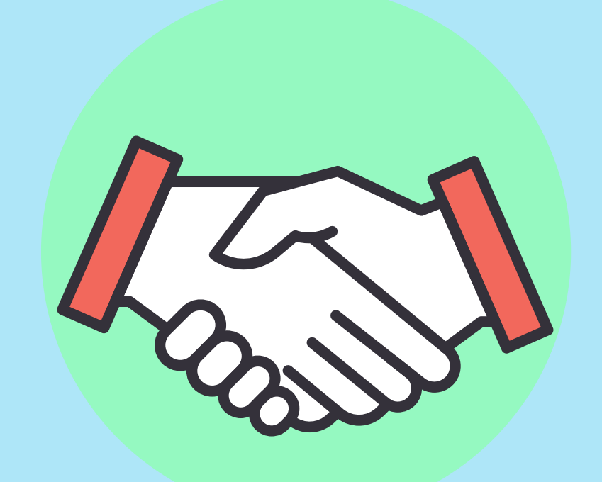
SUPPORTING LOCAL COMMUNITY SERVICES